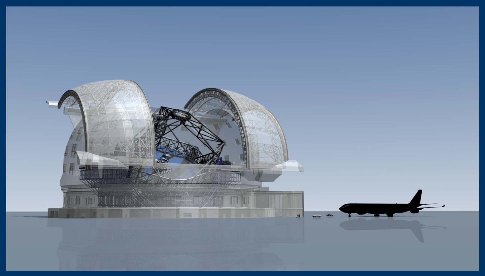
European Extremely Large Telescope (E-ELT): ~39m Op/IR telescoop Studies voltooid: klaar voor de bouw! (in principe goedgekeurd, mits ......