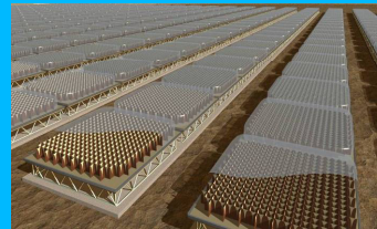
Electronically steerable antennas